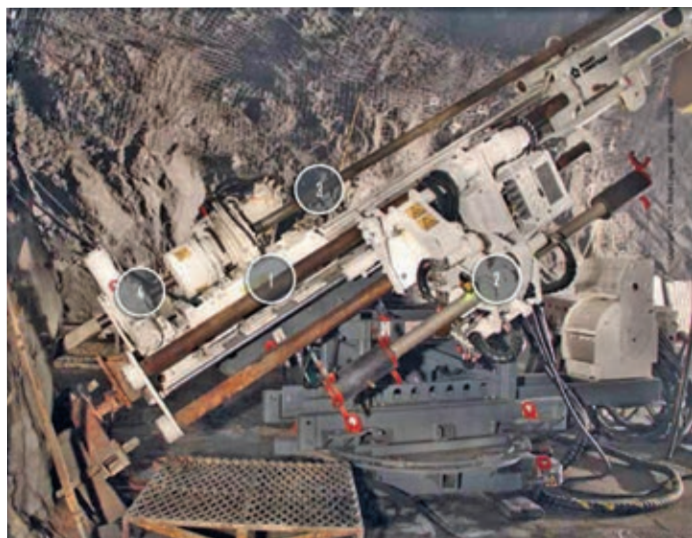
Particular features of Boart Longyear's LM110: 1. Reversible Feed Cylinder – this reversibility increases up-hole drilling capacity; 2. Semi-automated Rod Handling (Optional) – makes handling of rods safer and easier; 3. High Torque Breakout – breaks most rod joints automatically; 4. Fail Safe Rod Clamp – hydraulic open and spring close rod clamp results in fail safe operation

"New technologies in ore characterisation and extraction processes enable substantial economic and energy saving opportunities.