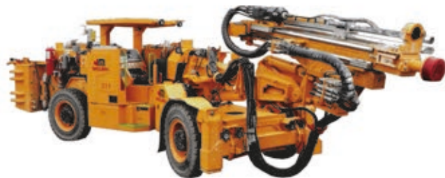
Ore Flow Facilitation Blockholers, Water Cannon

Celebrating 40 Years of Innovation! WWW.MACLEANENGINEERING.COM