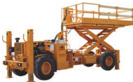
Utility Vehicles Scissor Lifts, ANFO Chargers, Fuel-Lube, & More!