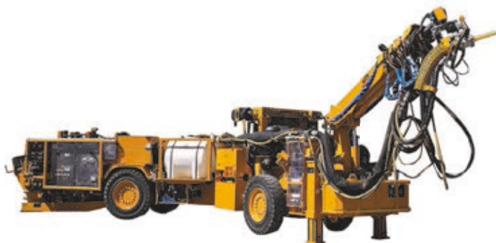
Shotcrete—Ground Support Sprayers, Transmixers, Agitators