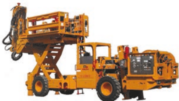
Bolters—Ground Support Series 900, Small Section Bolter, Utility Bolter